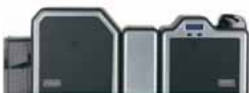
Lamination option and dual-sided printer/encoder